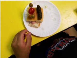
A monster sandwich

Dec. 14- We will have preschool classes. Make up day for no school on Nov.30