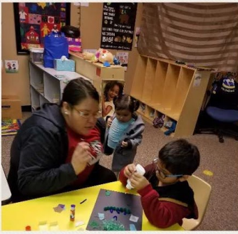
Monster storytime 2018

We had a story night with our parents. We made a monster sandwich.