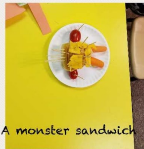
A monster sandwich