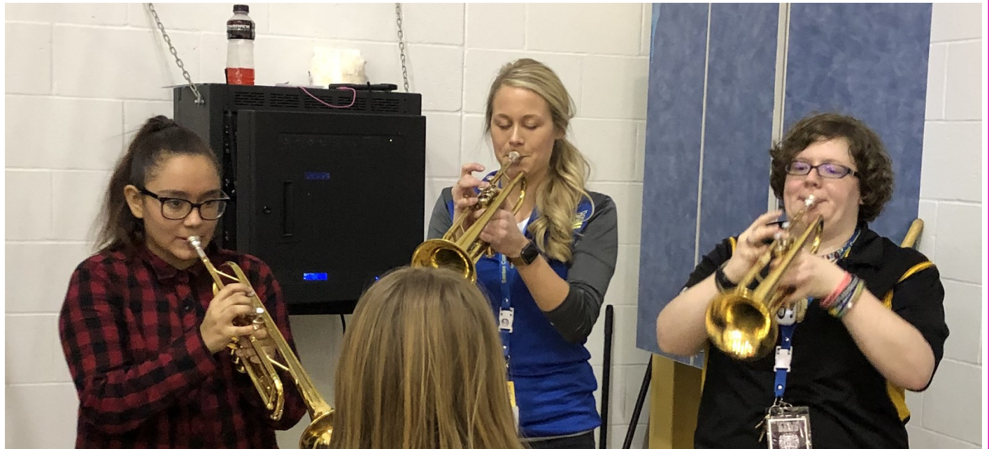
The Trumpet Trio plays “Seven Nation Army” at the Niobrara-Verdigre game!